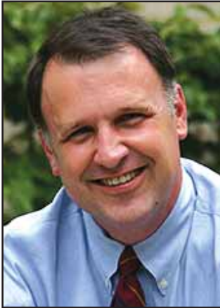
For Governor Creigh Deeds