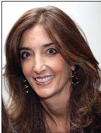
FILLER-CORN ... newest delegate

A multitude of Democrats from Arlington braved the foul weather and piles of black-