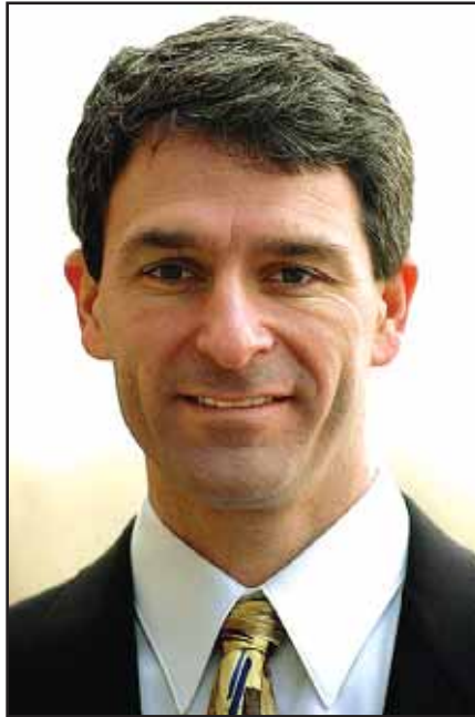
CUCCINELLI ... going overboard

Gov. Bob McDonnell has backed both suits. But on another issue, Cuccinelli went too far even for the governor. Early in March Cuccinelli wrote all the state's public universities telling them to remove references to gender discrimination from their campus non-discrimination policies. He said only the General Assembly could extend legal protection